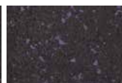
10. Purple Rain RFX-518