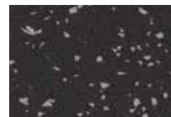
01. Night Fly RFX-517

The Gold Series provides RubberFlex "Impact" an economically priced option with all the benefits and quality of the total "Impact" series in ten colors.