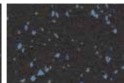
04. True Blue RFX-514