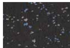
03. Earth Fragments RFX-513