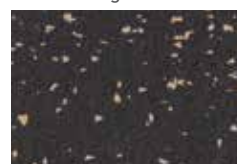
06. Tan Clay RFX-519