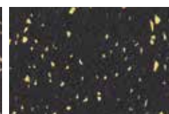
07. Yellow Moon RFX-520