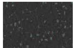
05. Leprechaun RFX-516