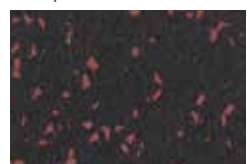
08. Terra Cotta RFX-515