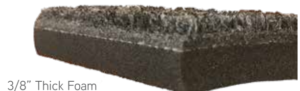
3/8" Thick Foam

Langhorn Flooring Concepts Your Source for Commercial Fitness Flooring (707) 823-4455 • www.langhornfci.com