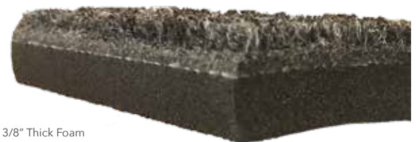
3/8" Thick Foam