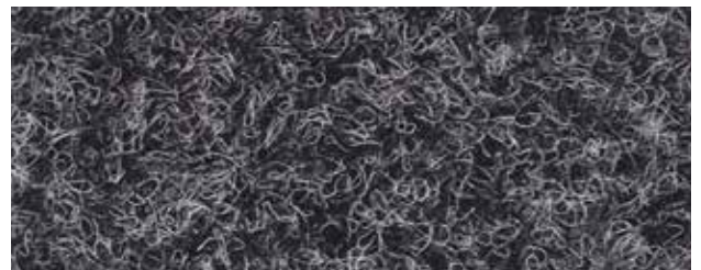
01. Midnight Grey