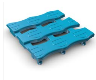
03. Light Blue