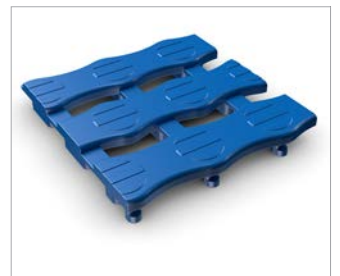
04. Ocean Blue