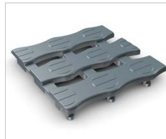
01. Light Grey

Made from soft Ethylene Vinyl Acetate and standing at 5/8" tall, the tiles are designed to deliver extra comfort and excellent drainage. The embossed surface provides a strong grip underfoot, while the anti-microbial and anti-fungal additives ensures excellent hygiene. This winning combination makes Heron tile the ideal slip-resistant interlocking tile for swimming pools, gyms and leisure centers.