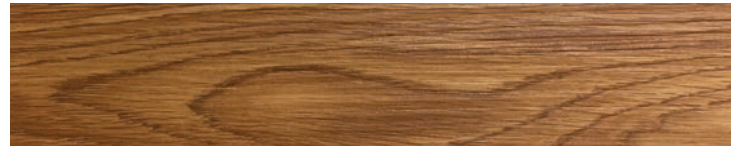
03. Honey Oak NV1018