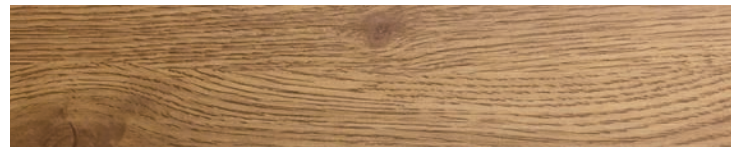
02. Pure Oak NV1012