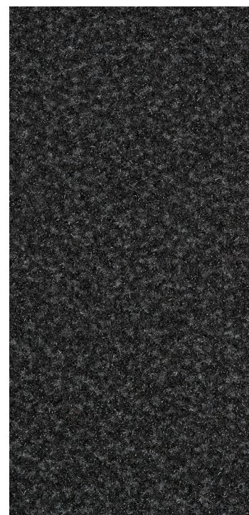
03. Black (Custom)