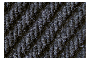
02. Coal 93