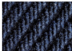
03. Deep Blue 90