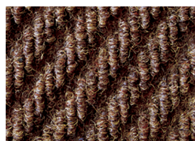
07. Pebble 114

A DIVISION OF VAN GELDER INC. Langhorn Flooring Concepts