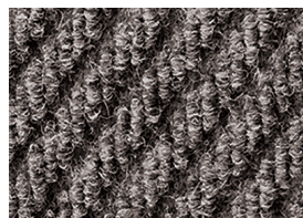
01. Grey 112

Made with 100% ASOTA® polypropylene fibers, this carpet is UV stable, stain resistant, durable and a highly resilient non-woven carpet. Titan Plus Carpet Tiles are engineered to withstand the constant foot and cart traffic found in many retail environments.