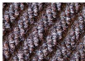
05. Heath 115