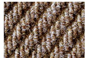
04. Bisque 116