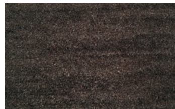
01. Dark Grey