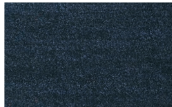
03. Navy Blue