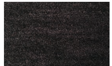
02. Charcoal Black