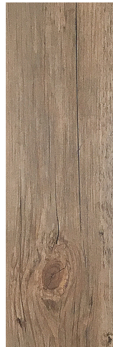
01. Weathered Barn NVR2166

By offering all the advantages of vinyl wood planks, Natures Edge is the superior choice when looking for comfort, beauty and performance.