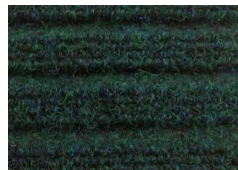
04. Forest Green 1807