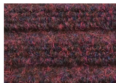
07. Burgundy 1806