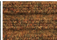
05. Honey 1805