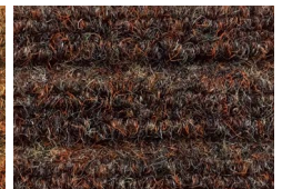
06. Coffee 1804