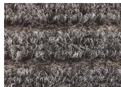
01. Mid Grey 1801

Spartus is a 4 x 2 ribbed corduroy product designed to scrape dirt and debris from heavy foot traffic. With distinctive good looks and outstanding performance, the aptly named Spartus is made to withstand high traffic areas, while creating a sense of motion in any indoor or outdoor application. Use Spartus for areas that need a hard wearing, easily maintained and low cost product.